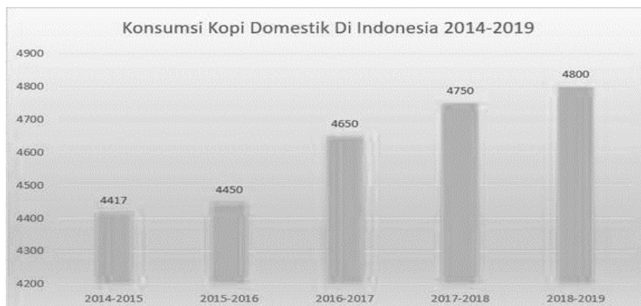
Figure 1. Domestic Coffee Consumption

Based on the data above, the growth of coffee shops has increased sharply. According to Toffin's independent research, the number of coffee shops in Indonesia has almost tripled compared to 2016, from only 1000 shops to 2950 shops.