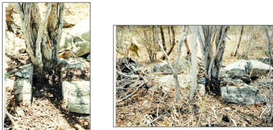
Photos 01 and 02 - Pseudopiptadenia contorta growing in open sub-vertical fractures in gneiss with direction E-W.

The arithmetic average found to the main hydrodynamic parameters of the wells of Conceição de Coité area are depth 64.77m; level static 7.83m; dynamic level 42.16m, flow 3.32 m 3 /h. Demonstrating that the level of groundwater is not very deep, the most common type of funding is always the tube well, with an average depth of 60 meters. A proof of this statement we see through the photos 01 and 02 timely occupation by a phreatophyte plant ( Pseudopiptadenia contorta ) in open sub-vertical fractures, with direction E-W in the town board.