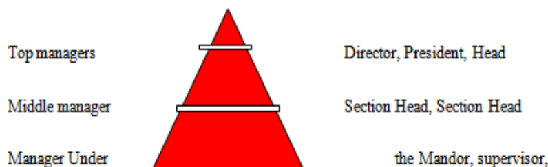
Figure 2. Lpel hierarchy of Leadership