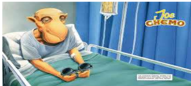
A seriously ill camel mascot of a cigarette brand