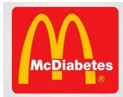
showing the ill effects of junk food