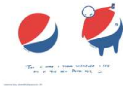
Pepsi's "fat man"